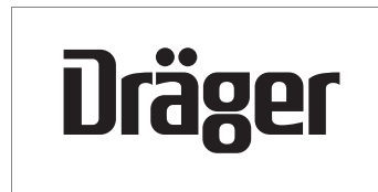
Black and white implementation, positive

The logo is normally in Dräger blue on a white background.