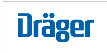
Dräger blue, positive/negative